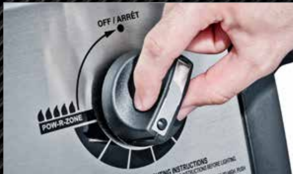
180 DEGREE CONTROL