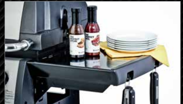
EPOXY-PAINTED STEEL SIDE SHELVES