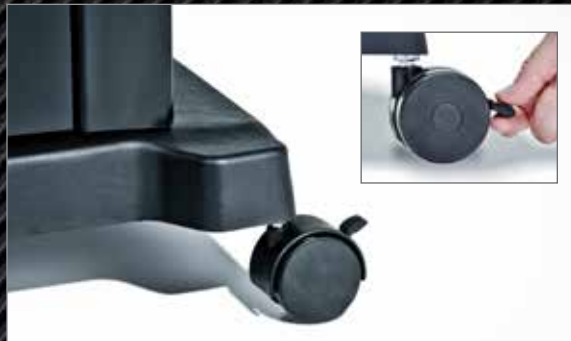
DURABLE RESIN CASTERS