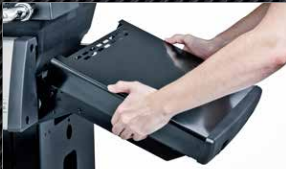
FOLD DOWN SIDE SHELVES